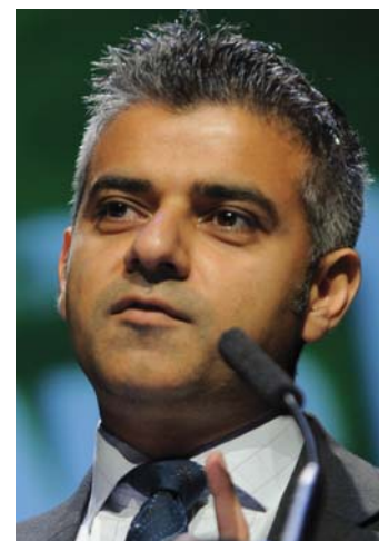
Sadiq Khan MP

and that they should make the most of the organisation as a resource.